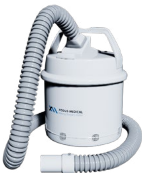
Reusable Air Supply Unit #41685