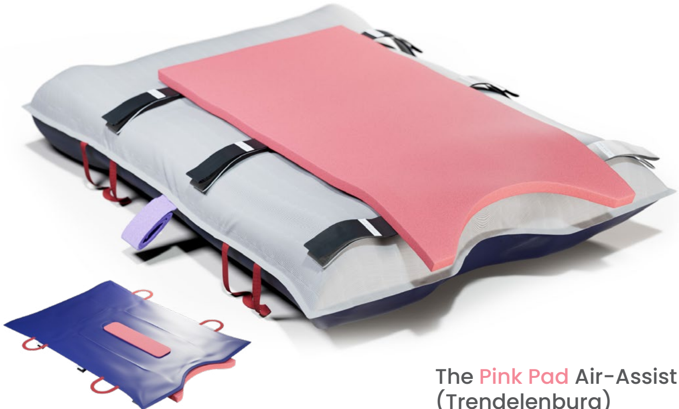
The Pink Pad Air-Assist (Trendelenburg)

Integrating The Pink Pad® into both top & bottom surfaces ensures skin protection, as well as patient stability in both Trendelenburg & Reverse Trendelenburg