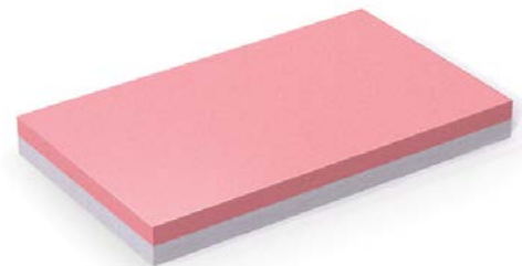
Also Available Separately: Reverse-T Footboard Pad 20"x12"x2" (#40548)

The Pink Reverse-T Kit™ requires less than one minute to set up. A single-use design minimizes cross-contamination risk and improves OR turnover times.