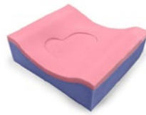
40450 Single-Use, Skin-Friendly Pediatric Head Positioner