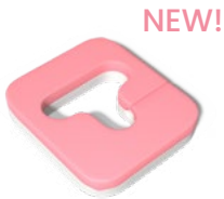
40489 PinkProtect Child Prone Head Positioner (Extra-Small)