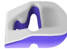
40699 Small ProneSafe Head Positioner w/ DermaProx Insert