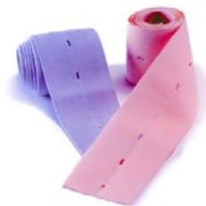
30150 Button Hole Belt