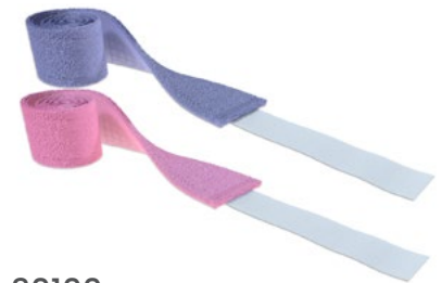
30100 Labor & Delivery Strap