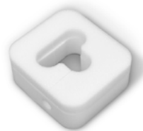
40485 Pediatric Prone Head Positioner (Large)