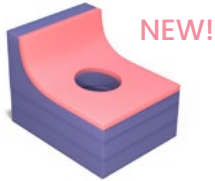
40488 Adjustable Lateral Head Positioner (Small)