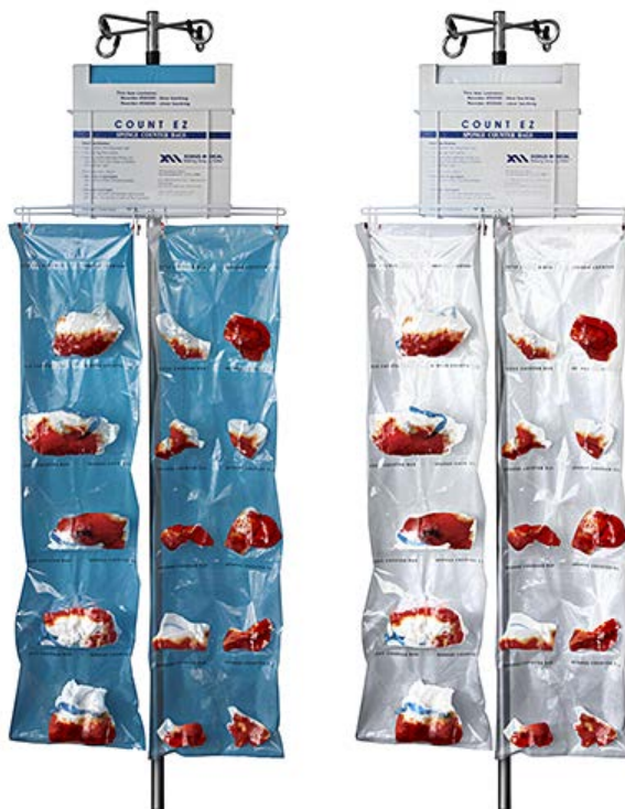
Attachable Sponge Counter Dispenser Rack (Sold Separately)