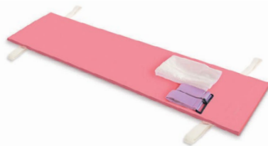
40600 Pink Pad EXT™ 2/case - 72" x 20" x 1"