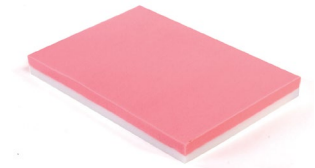
40772 Standard Dual Layer Pad 48/case - 8" x 11" x 1"