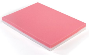
40771 Large Dual Layer Pad 24/case - 15" x 11" x 1"