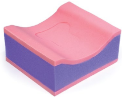
40519 Supine Headrest 16/case - 9" x 8" x 4"