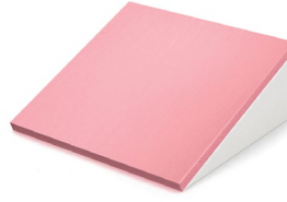
40499 PinkProtect™ Prone Wedge 4/case - 19.25" x 18" x 7"