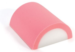
40544 Pink Arcs (standard) 16/case - 9" x 8" x 4"