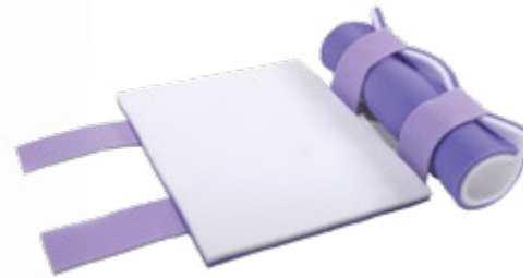
Optional One-Step Arm Protectors Available (#40433)