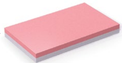
Also Available Separately: Reverse-T Footboard Pad 20"x12"x2" (#40548)

The Pink Reverse-T Kit™ requires less than one minute to set up. A single-use design minimizes cross-contamination risk and improves OR turnover times.