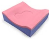
40450 Single-Use, Skin-Friendly Pediatric Head Positioner