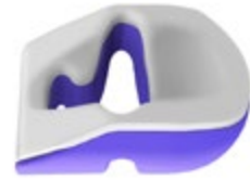
40699 Small ProneSafe™ Head Positioner w/ DermaProx™ Insert