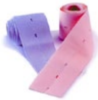
30150 Button Hole Belt