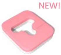
40489 PinkProtect™ Pediatric Prone Head Positioner (Extra-Small)