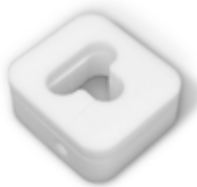
40485 Pediatric Prone Head Positioner (Large)