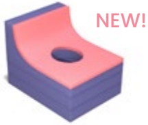
40488 Adjustable Lateral Head Positioner (Small)