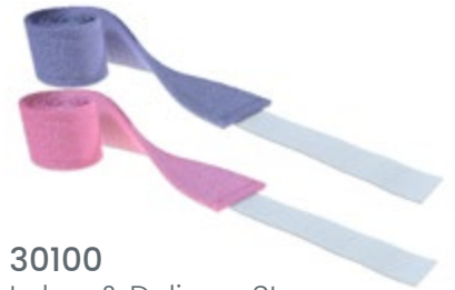
30100 Labor & Delivery Strap