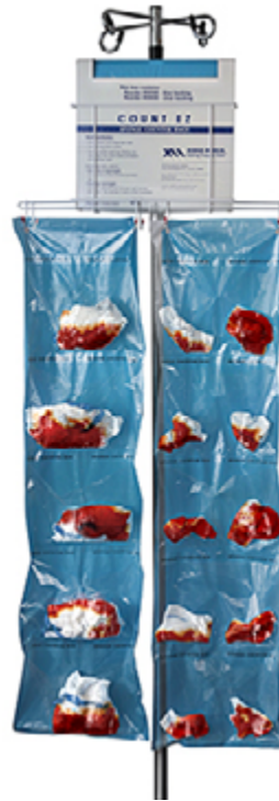
Attachable Sponge Counter Dispenser Rack (sold separately)