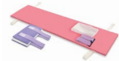
40602 Pink Pad EXT™ w/ Arm Protectors 2/case - 72" x 20" x 1"