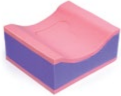
40519 Supine Head Positioner 16/case - 8" x 9" x 4"