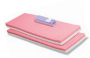
40547 Dual Layer Arm Board Pads 8 Pairs with straps /case - 28.75" x 7.8" x 1.5"