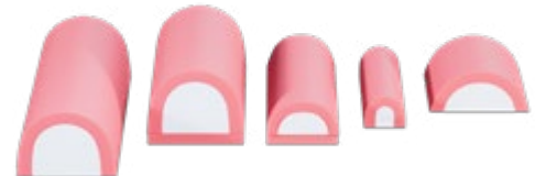
Various Options Available Pink Arcs