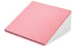
40499 PinkProtect Elevation Wedge 4/case - 19.25" x 18" x 7"