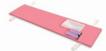
40600 Pink Pad EXT™ 2/case - 72" x 20" x 1"